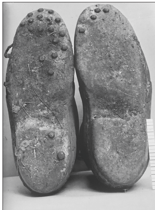
Figure 3: Example of a shoe sole photograph taken by Reiss