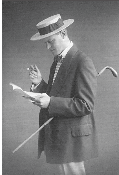
Figure 1: Rudolf A. Reiss (1875–1929)

Reiss (see Figure 1) was born on 8 July 1875, the eighth of ten children of a prosperous landowner in the Grand Duchy of Baden in Germany. Although he almost certainly never had to go without, he later himself said that he often felt abandoned and alone. That might well have been a reason for his deciding to move to Lausanne in Switzerland to study after leaving school. Reiss embarked on a degree in chemistry at Lausanne University, which he completed successfully in 1898 with the title of doctor. It was during his time at university that he also discovered his passion for photography, which was to accompany him for the rest of his life. He became a member of the still young Photo Club and also successfully participated in various international competitions for amateur photography. After completing his degree, he accepted the position of assistant to his doctoral supervisor, but just one year later (1899) he had already been appointed head of the as yet non-existent